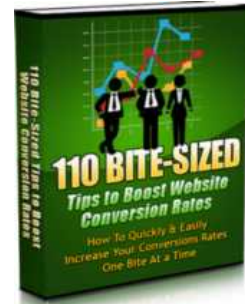
110 Bite-Sized Tips To Boost Website Conversion Rates

Writing killer E-Mails is an essential survival skill in Internet Marketing. If you don't develop the skill, you won't be able to survive. Invest in learning this priceless skill now and guarantee your future success!