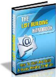
The List Building Handbook

Over 300 powerful tips, tricks and tactics from A-Z to help you build an Internet Empire!